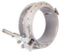
Segmented Collar Type