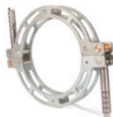
Split Collar Type